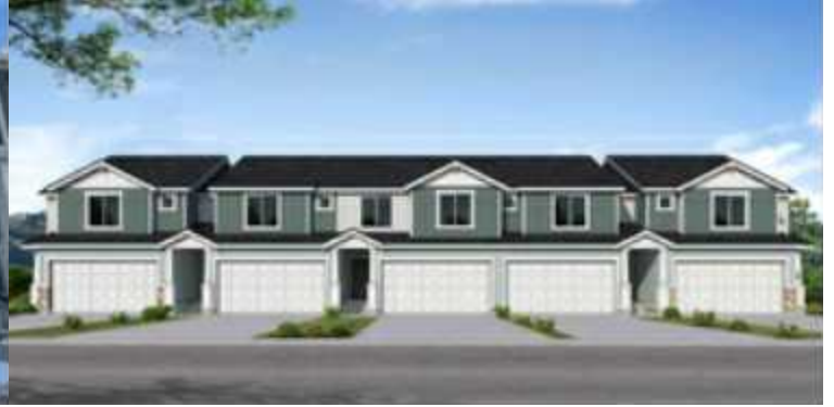
● SOLD Residential Sold Price: $429,990 MLS#: 1973581 2187 SqFt. 3788 S Bald Knoll Dr #1475 Magna, UT 84044