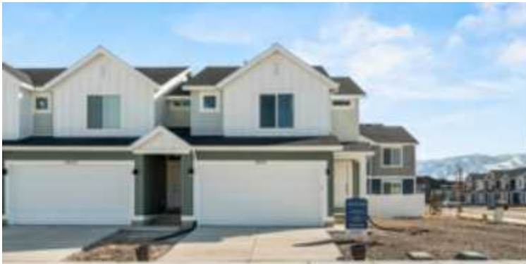
● SOLD Residential Sold Price: $434,990 MLS#: 1978524 2187 SqFt. 3789 S Bald Knoll Dr #1464 Magna, UT 84044