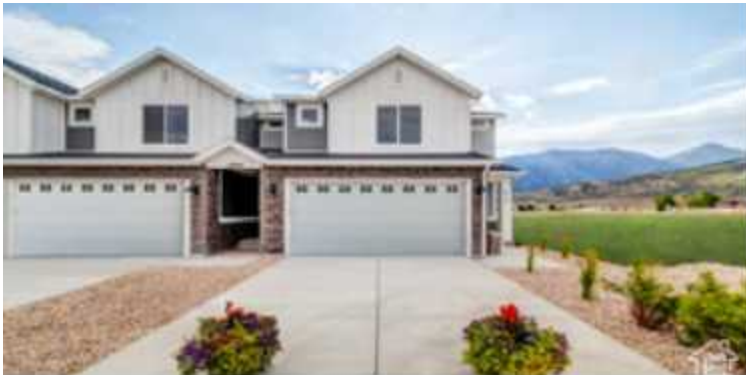
● SOLD Residential Sold Price: $444,990 MLS#: 1982721 2187 SqFt. 3782 S Bald Knoll Dr #1472 Magna, UT 84044