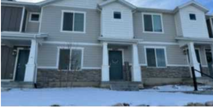
● SOLD Residential Sold Price: $393,000 MLS#: 1974415 1503 SqFt. 8493 W Bowie Dr Magna, UT 84044