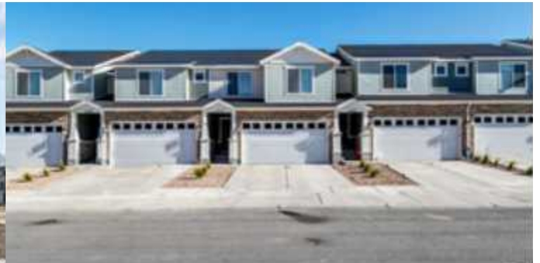
● SOLD Residential Sold Price: $444,990 MLS#: 1982372 2187 SqFt. 3776 S Bald Knoll Dr #1470 Magna, UT 84044